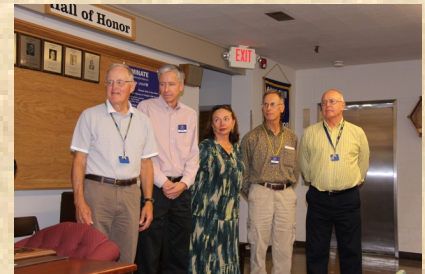
The new Board members are installed.