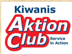
WISD Aktion Club