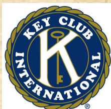
Huron High School Pioneer High School