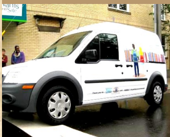
The Family Learning Institute "bookmobile" purchased with a grant from our club in 2014.