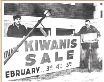
The Early Days