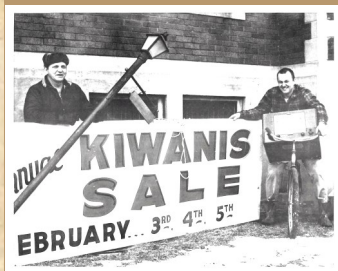
The Early Days