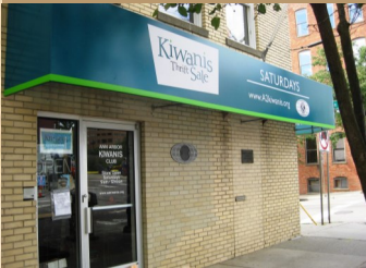
This is what we call HOME... now in our 94th year.