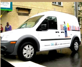
The Family Learning Institute "bookmobile" purchased with a grant from our club in 2014.