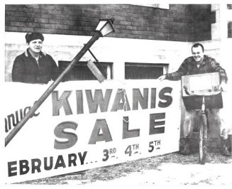
The Early Days