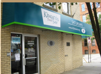
Kiwanis Center Downtown