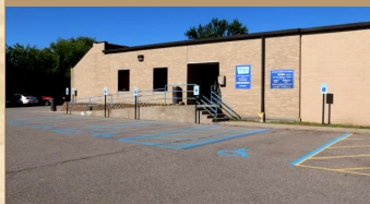
Kiwanis Center West