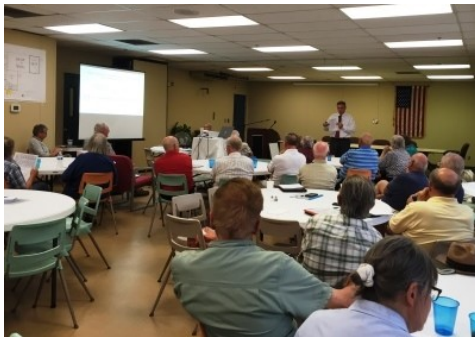
Informational Meeting of September 7

Our club has now completed four informational meetings concerning the proposed sale. The latest was on the evening of September 7 at KCW. These meetings are neither sequential nor categorized in any fashion. They are at convenient times to encourage you to come as often as you'd like to consider the KCD sale proposal, ask questions, air your concerns, and come together as a group. One more informational session is scheduled at the club meeting of September 12. The membership vote on the issue is scheduled for the Noon club meeting of September 19 at Kiwanis Center Downtown.