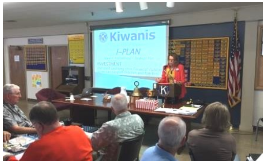
Members and volunteers discussed the proposed sale at Monday's meeting.