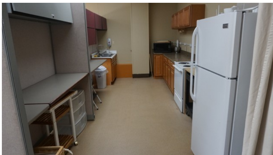
Interior of the catering kitchen (still in progress).

Our Sponsored Programs in Service to Youth: