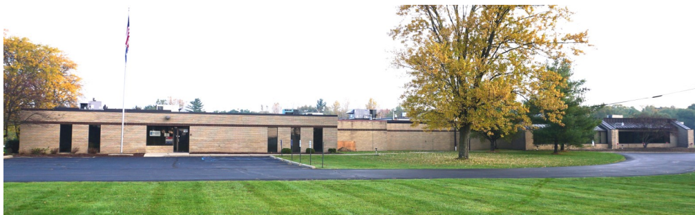
The Kiwanis Center

Interested in becoming a member? Please send an e-mail to MembershipGrowth@a2kiwanis.org or visit the website www.a2kiwanis.org .