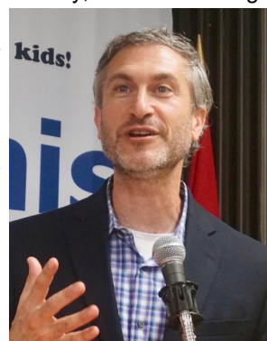
Mayor Christopher Taylor

The question of making city elections nonpartisan was raised and discussed. The mayor favors the partisan label, saying the party designation says a lot about the principles and positions that candidate endorses. The new train station for a light rail line is moving very slowly through Federal processes. The current staff parking lot north of Fuller