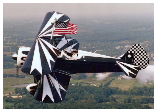
God Speed Bob.