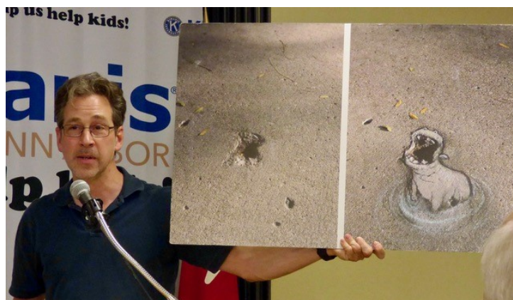
David Zinn's "before and after" images of an imperfection in a sidewalk