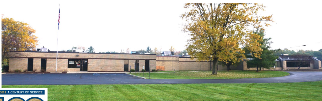
The Kiwanis Center

Interested in becoming a member? Please send an e-mail to MembershipGrowth@a2kiwanis.org or visit the website www.a2kiwanis.org .