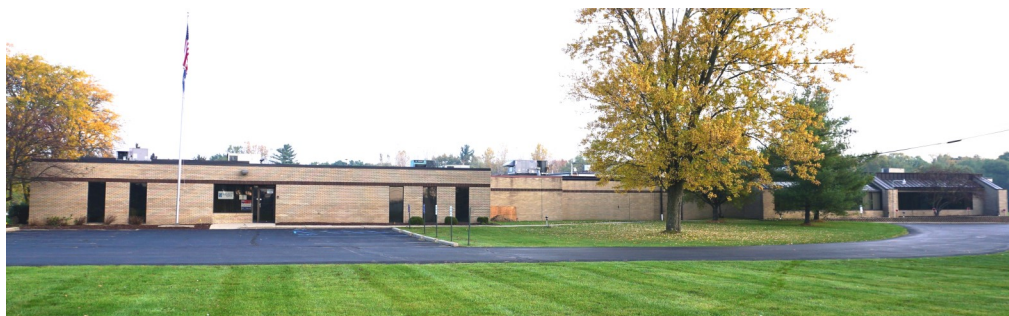
The Kiwanis Center

Interested in becoming a member? Please send an e-mail to MembershipGrowth@a2kiwanis.org or visit the website www.a2kiwanis.org .