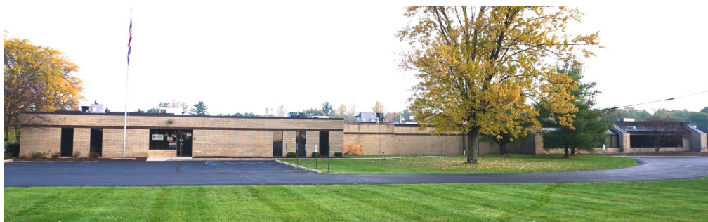
The Kiwanis Center

Interested in becoming a member? Please send an e-mail to MembershipGrowth@a2kiwanis.org or visit the website www.a2kiwanis.org .