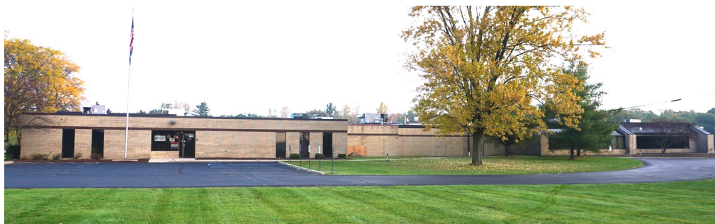
The Kiwanis Center

Interested in becoming a member? Please send an e-mail to MembershipGrowth@a2kiwanis.org or visit the website www.a2kiwanis.org .