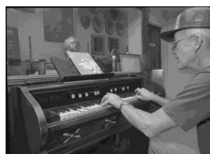
Piano Concert 1982