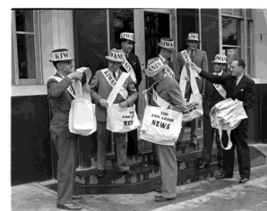
1938 Newspaper Sale