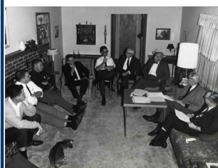
Club Meeting 1968