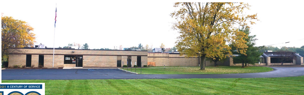
The Kiwanis Center

Interested in becoming a member? Please send an e-mail to MembershipGrowth@a2kiwanis.org or visit the website www.a2kiwanis.org .