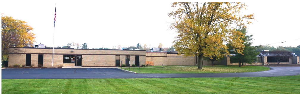
The Kiwanis Center

Interested in becoming a member? Please send an e-mail to MembershipGrowth@a2kiwanis.org or visit the website www.a2kiwanis.org .